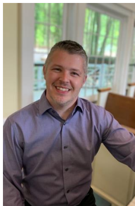
Director of Music, All Saints Episcopal Church, Hilton Head Island SC