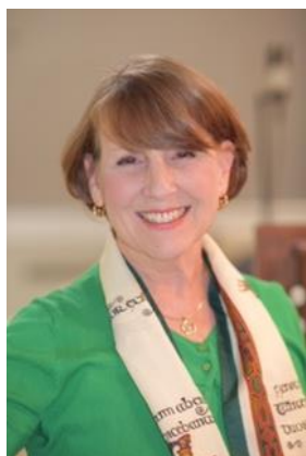
Music Director, St. Gregory the Great Catholic Church, Bluffton SC